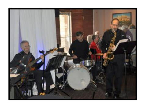
Entertainment: The Crabtown Combo